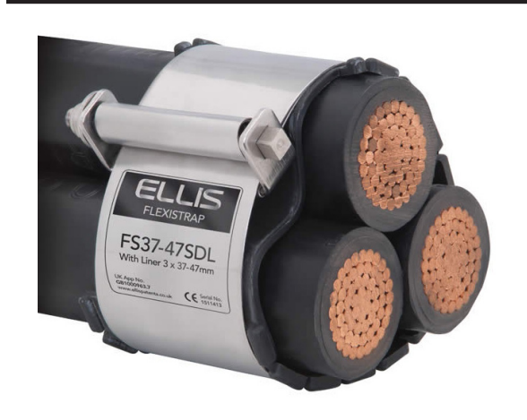
STANDARD DUTY SUITABLE FOR USE WITH VULCAN+ CLEATS